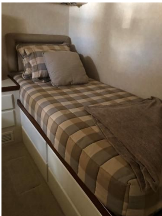
Guest Stateroom 2