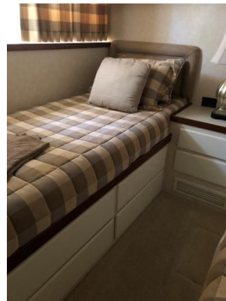
Guest Stateroom 2